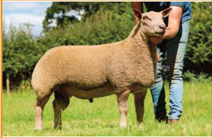
BOYO COMMANDER 24XHE01549 ARR/ARR

Purchased in conjunction with Sercombe Sheep for £12,000.