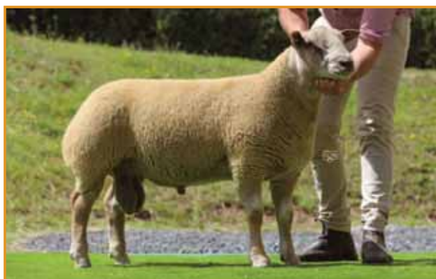
EDSTASTON BEST BAR ONE

Top 5% daughter out of Edstaston Wasabi 20TG00977 by the 4,000 gns. Dalby Ancelotti 22PE10661. Wasabi was out of the great show sheep Edstaston Samantha 17TG00622 whose granddam was the very influential ewe ZFY6073 purchased at the Rutland dispersal sale. A Samantha daughter 21TG01089 by Rockdale U2 H28-19-035 sold for £5,000 to the Boyo flock in 2022. Lot No. 7 23TG01318 is a full sister to the two top 1% Indexed rams Edstaston Best Bar One 23TG01316 and Edstaston Catch Me If You Can 24TG01449.