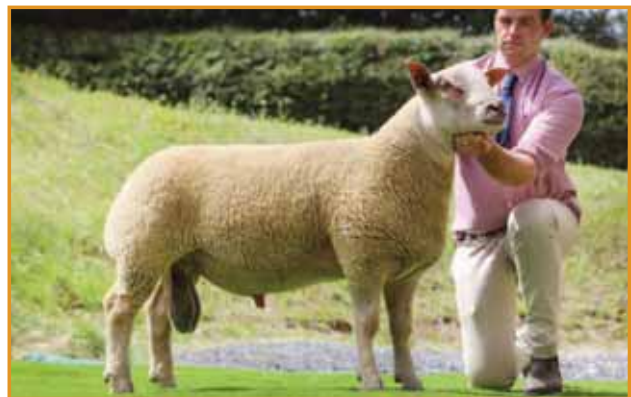
Edstaston Beau Jangles