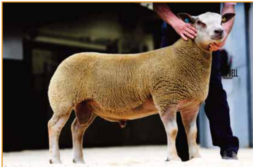
EDSTASTON CATCH ME IF YOU CAN

Top 1% indexed ram 433 who was sold at Carlisle Supreme Sale 2024 for 3,000 gns to the Dalby flock with a half share retained.