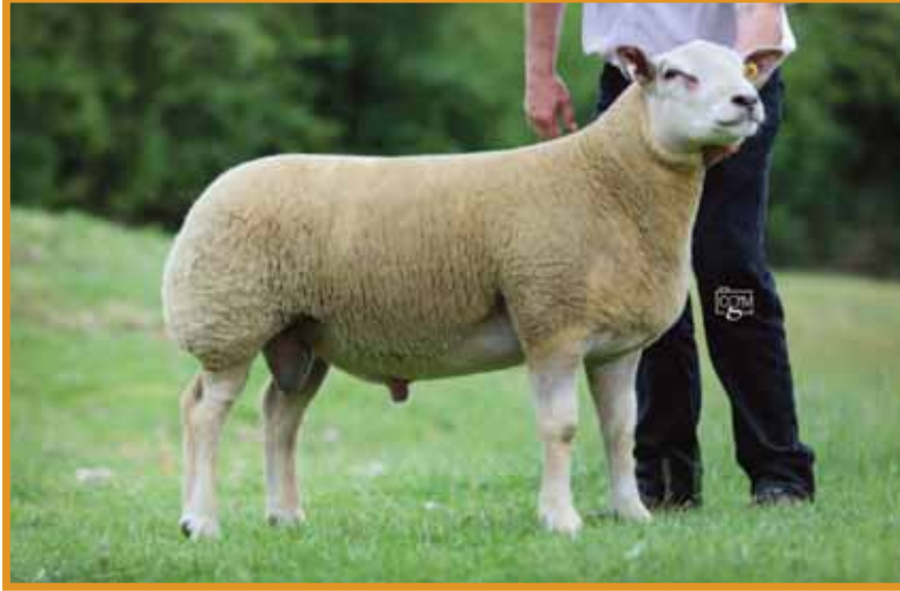
DALBY ANCELOTTI 22PE10661 ARR/ARR INDEX 359

Purchased for 4,000 gns in conjunction with the Bronwydd flock at Worcester Premier Sale 2022.