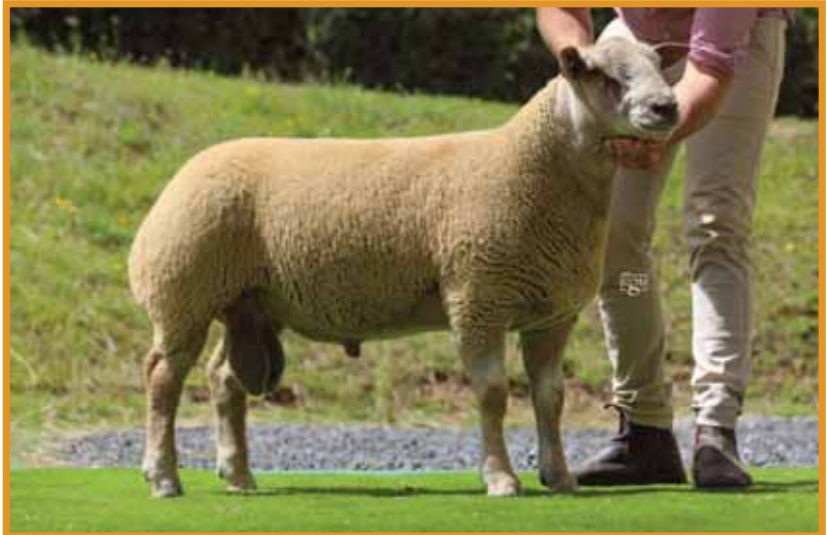
EDSTASTON BEST BAR ONE

Purchased for 4,000 gns in conjunction with the Bronwydd flock at Worcester Premier Sale 2022.