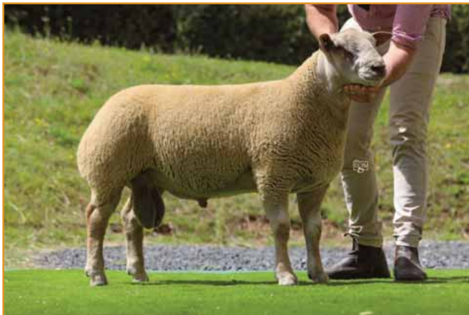
EDSTASTON BEST BAR ONE

See notes at the front of the catalogue for more information on the 4,000 gns. Dalby Ancelotti.