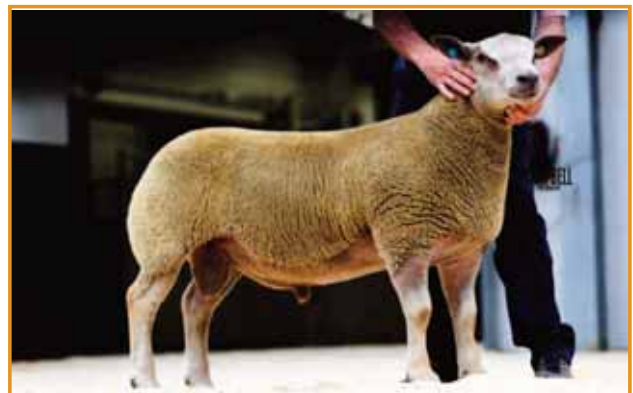
Edstaston Catch Me If You Can

Catch Me If You Can is jointly owned with Sercombe sheep and is the No. 2 Terminal Sire on Signet with an Index of 446. Semen has been sold worldwide to New Zealand, Mexico, Canada and Ireland.