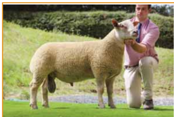
EDSTASTON BEAU JANGLES