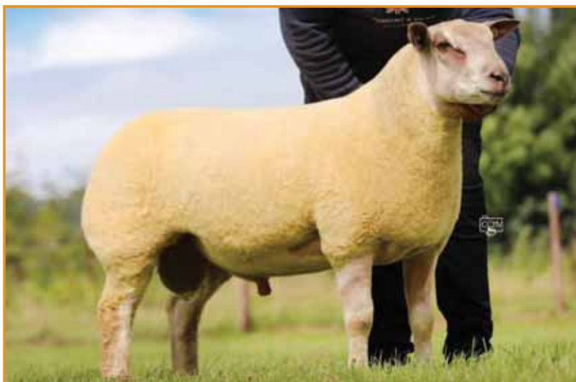
EDSTASTON BAD BOY