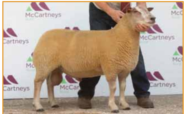
Edstaston U R The Man