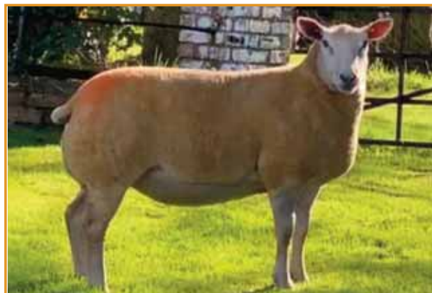
RIGGHEAD DAM OF LOT 14

Dam was purchased at Worcester Saucy Sale for 1,400 gns as a yearling after previously having been champion Charollais at the 2019 Dumfries show as a ewe lamb. Sire Tullyear Artemis has sold females to £3,000 twice for 24TG01436 and 24TG01456 to Fursdon and Boyo flocks respectively. A daughter in the sale is Lot No. 41