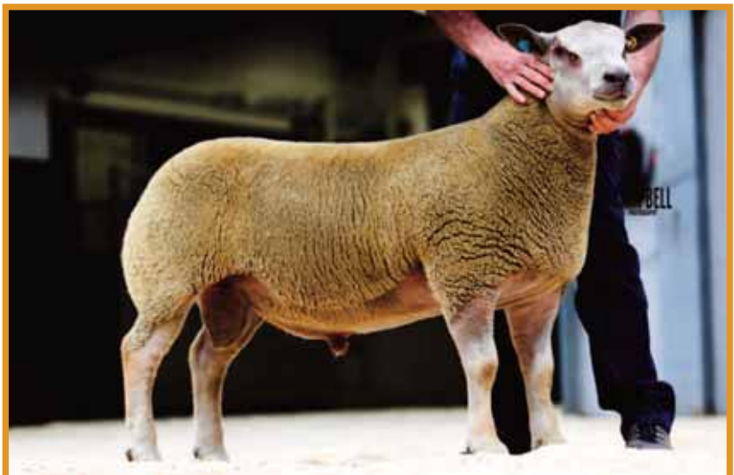
EDSTASTON CATCH ME IF YOU CAN

Also sired Edstaston Catch Me If You Can 24TG01449. Sold for 3,000 gns to the Dalby Flock, with a half share retained.