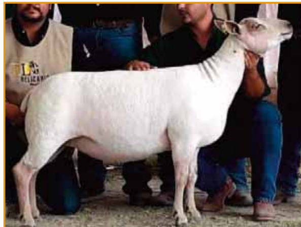
EDSTASTON OCEANIA DAUGHTER IN MEXICO

Edstaston Umpire Dickie Bird has bred very well in Canada and New Zealand. He was used very sparingly in the Edstaston flock due to his close breeding. Dam is Edstaston Oceania 14TG00340 the exceptional breeding ewe by Wernfawr Magnum 12XEV00325 out of ZFY6073 purchased at the Rutland dispersal sale. Oceania was dam of the Supreme Female Charollais Champion at Mexico's National Show in 2021.