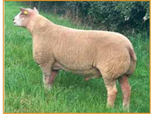
Edstaston Chip and Pin

Chip and Pin is out of Edstaston Tamsin by Tullyear Artemis. Full brother sold for 1,000 gns. to the Wraycastle flock at Carlisle Supreme Sale 2024 and two full sister sold for £3,000 to the Boyo and Fursdon flock.