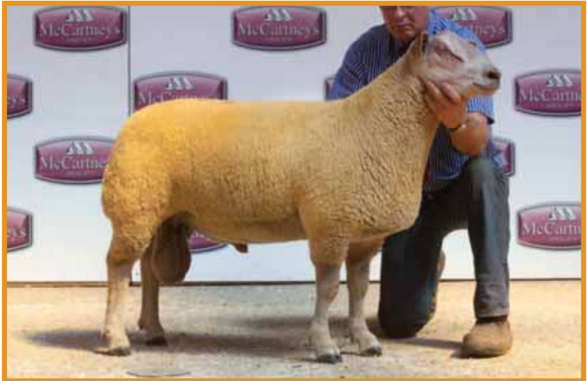
Son Edstaston Tempranilo 18TG00760 sold 2018 Premier Sale to E Buckley and J Jeffrey for 5,800 gns.

He has bred well for a large number of flocks producing many high priced sheep and several high profile show winners both in the U.K. and Mexico where a daughter out of Edstaston Oceania 14TG00340 won the supreme Champion Charollais female in 2021.