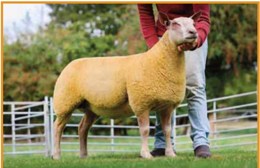
Daughter 25TG01510 sold to Graham Foster Oktoberfest 2025.