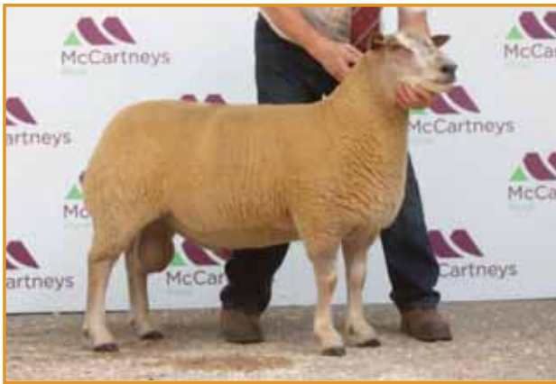
EDSTASTON U R THE MAN