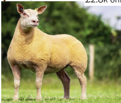
Manor House Duchess - sold for £2.8k online