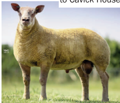
Manor House Destino - sold to Cavick House