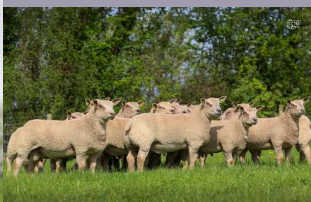
PATERNAL BROTHERS TO THE EWE LAMBS OFFERED FOR SALE.