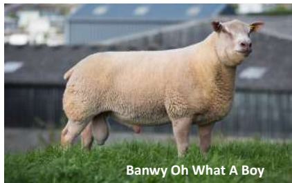
Banwy Oh What A Boy

Put an unmistakable mark on his lambs, cocky eared blocks of meat with skins.