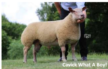
Cavick What A Boy!

The most recent tup to be purchased by Oakchurch, albeit as a quarter share, but what a mark he has already left. We're incredibly impressed with the shape and presence of these lambs, giving us everything we wanted - power, meat and style.