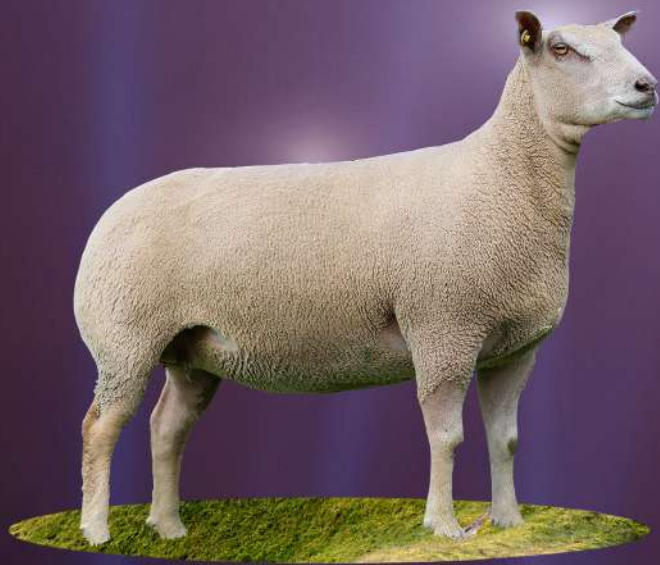
LOT 69 OAKCHURCH 21WKW00927