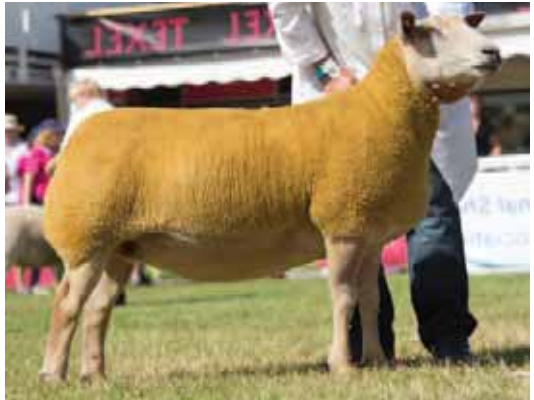
Arbryn One & Only

All shearlings have been out wintered till mid March and have only had concentrates during the last three weeks before the sale