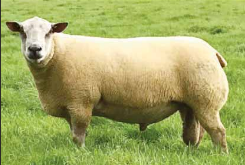
Knockin Shockin ~ 17XXJ00376