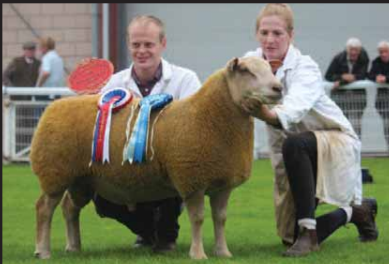
Moelfryn Tip Top ~ 18WGC00221