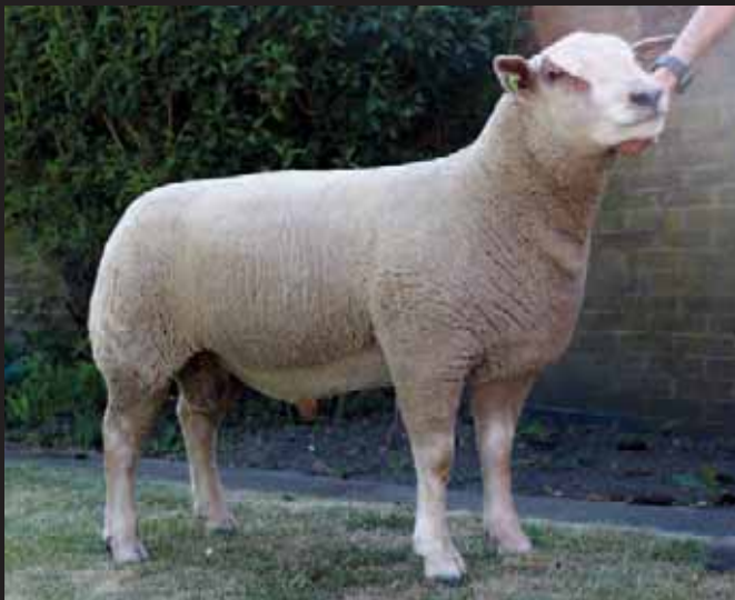
Dalby Veainu ~ 20PE08783