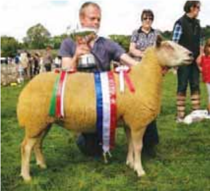
Dam of Moelfryn Tip Top

Tel: 07964 374393 Email: gethind622@gmail.com