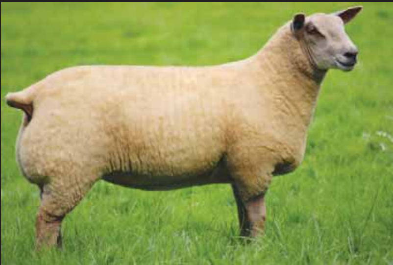
LOT 67 ~ EDSTASTON 20TG00987