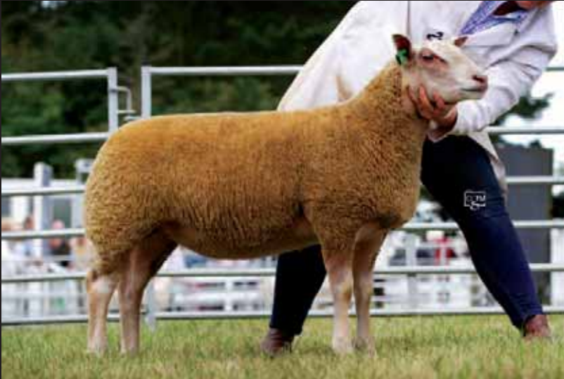
Lot 44 - 19WKM01428 - 1st prize ewe lamb Royal Cornwall Show 2019