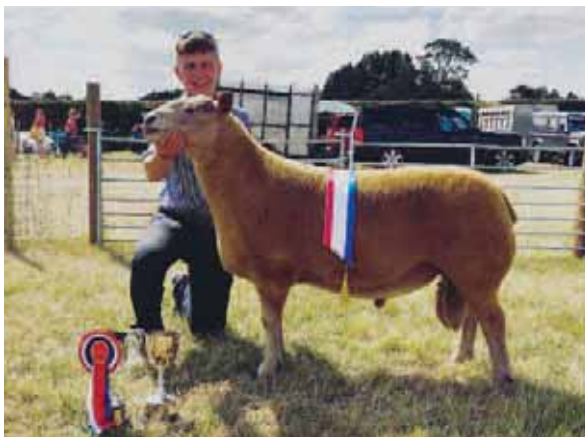
Edstaston Rockin Robin - 16TG00561

They have been outside from the 10th January, even in harsh weather! On the Heptavac P System, mineral drenched and Dectamax before the sale.