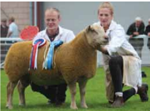
Moelfryn Tip Top

All three are ARR/ARR and have been toxovaxed, enzovaxed and on the Heptavac P+ system.