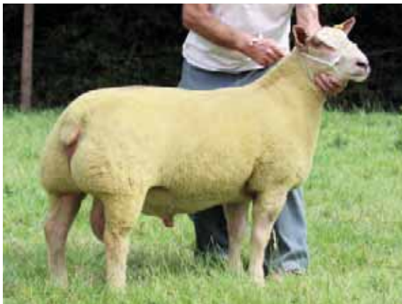
HILLSIDE TENNYSON : 18VBK00237