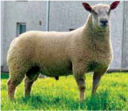
Springhill Viking - 20WLK05032