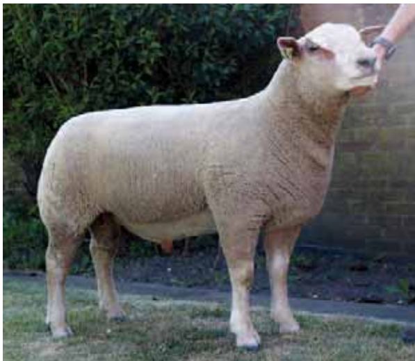
DALBY VEAINU - 20PG08783

They have been vaccinated with Enzovax and are on the HeptavacP+ system.