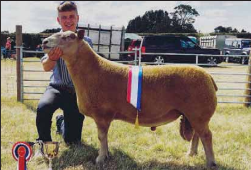
Edstaston Rockin Robin ~ 16TG00561