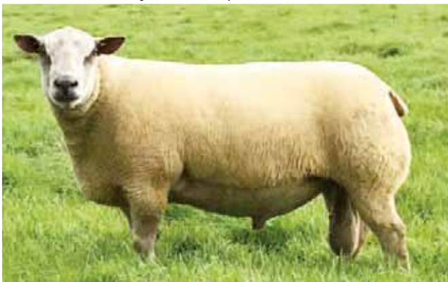
KNOCKIN SHOCKIN : 17XXJ00376

Purchased for the record price of 25,000 gns. Shockin needs no introduction having produced progeny that have excelled in both sale and show rings. He now has sons that are producing the goods with several grandsons realising four figures at sales. Coupled with this is the performance data with Shockin's Terminal Sire Index currently being 345 which places him comfortably in the top 1% for the breed.